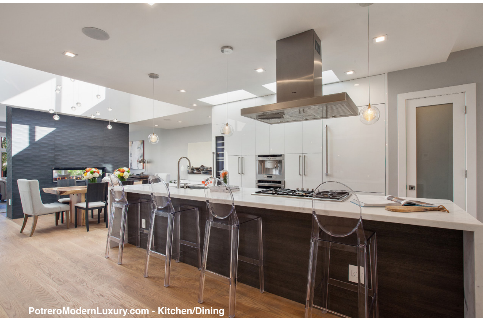
PotreroModernLuxury.com - Kitchen/Dining

appreciate most about me and why I have so many referrals.” She also values her relationships with other REALTORS®. “It’s extremely important to me to maintain lasting relationships with other real estate agents,” she says. “Doing so helps everyone involved in any sale, but especially the clients, whether they’re selling or looking to buy a home.”